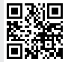
Betty Brite Cleaners