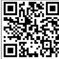
Active Lifestyle Centre