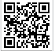
Collins Formal Wear

SCAN OUR 2013 WEDDING SHOW ADVERTISERS QR CODES