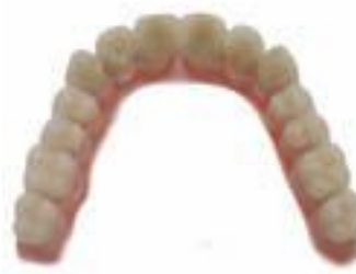
Secure Upper Denture