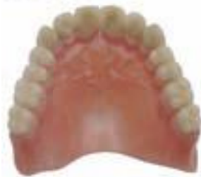
Conventional Upper Denture