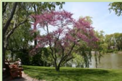
A view of the Thames River from the River Road, 2009