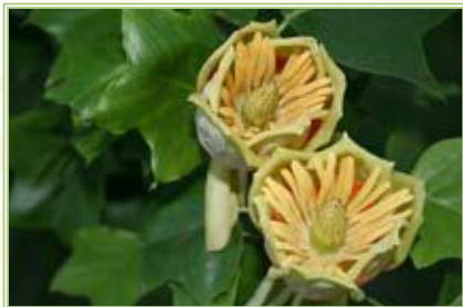
Tulip Tree Chatham-Kent , 2009

Have an image you would like to see in next year's CK Outdoor Living Magazine? E-Mail your image with the details of where and when it was taken to info@athielmarketing.com or drop off the file at 159 King Street West, Chatham Ontario.