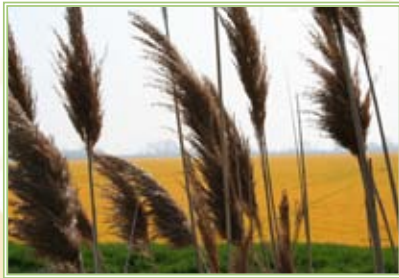
Farmers Field near Lighthouse Cove, 2009