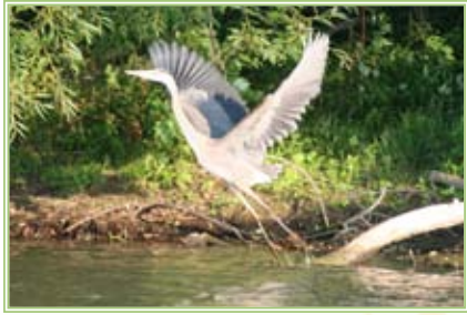
Blue Heron on the Thames River, 2010