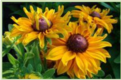
Rudbeckia Tiger Eye Gold Communities In Bloom Flower of the Year For Chatham-Kent, 2010